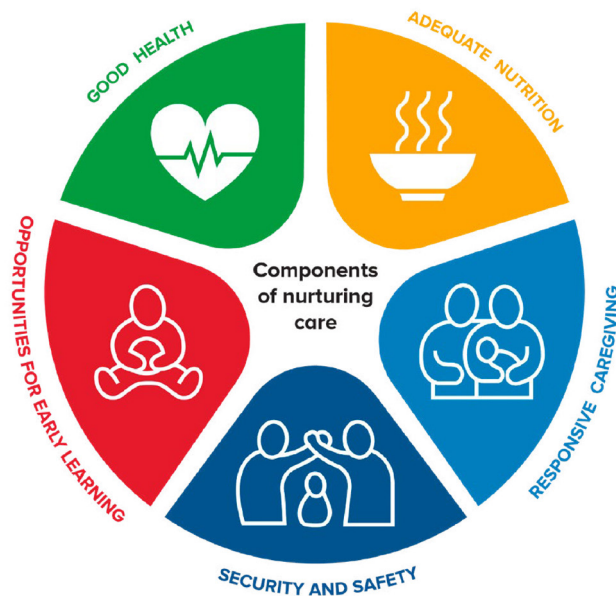
Fig. 1 Components of Nurturing Care for ECD